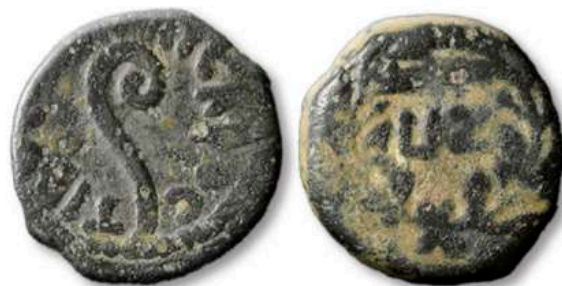
TIBEPHOY KAICAPOC lituus right