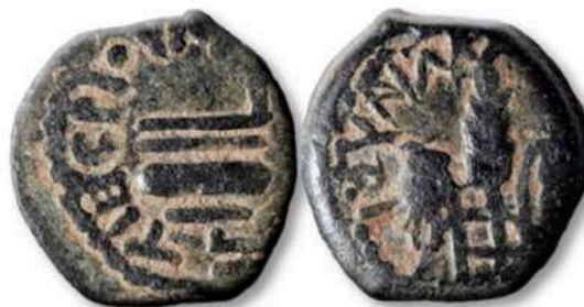
TIBEPHOY KAICAPOC LI Simpulum